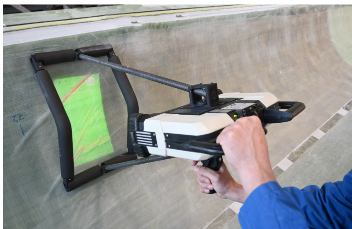
RESULTS ARE PROJECTED DIRECTLY ON TO THE BLADE