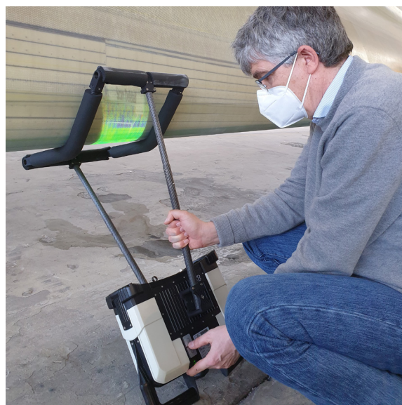
LEADING EDGE SCANNING WITH waveCHECK

waveCHECK is a handheld-portable 3D-inspection tool for wind turbine blade manufacturing and quality inspection. The user-centric design allows for quick deployment in existing workflows. Non-contact precision optical measurement that revolutionizes blade inspection.